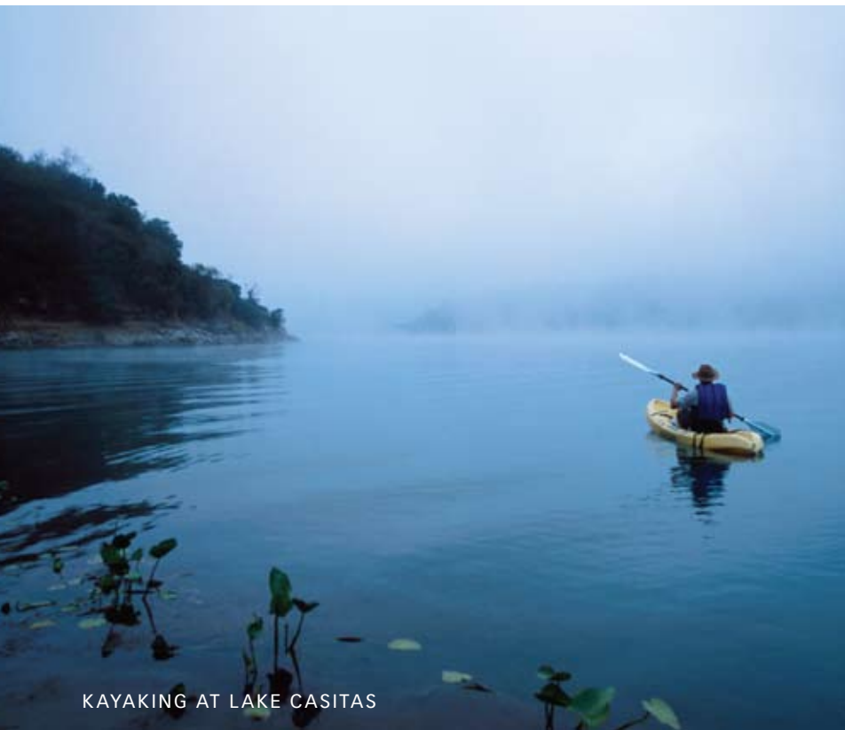
KAYAKING AT LAKE CASITAS