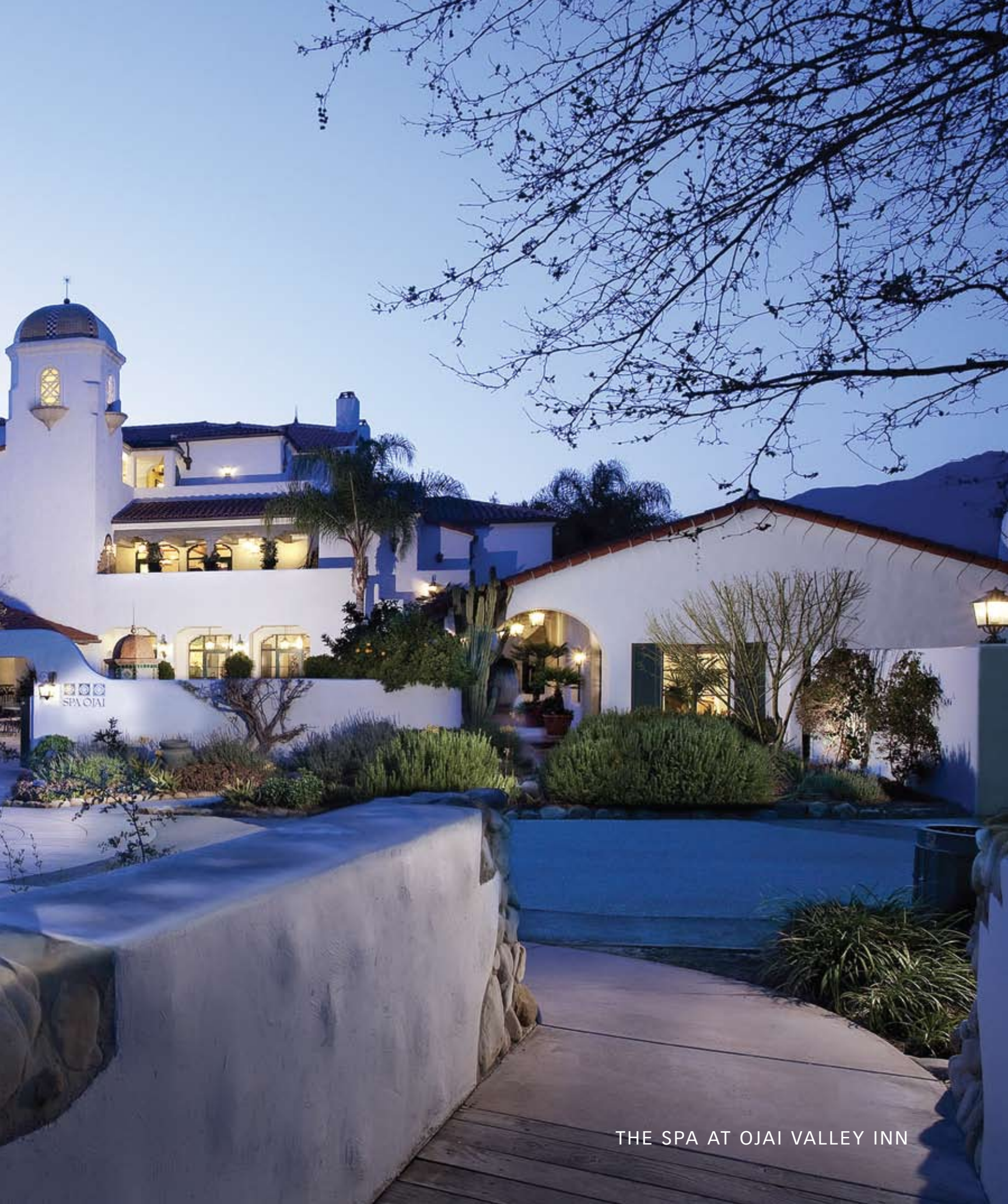
THE SPA AT OJAI VALLEY INN